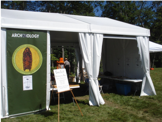
The Archaeology Merit Badge Booth 2013.