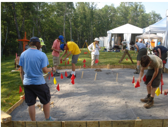
Scouts place artifacts back in context on the replica site and draw conclusions about the residents of the site.

scouts, scout leaders, parents, and visitors the rudiments of archaeological inquiry, some experimental archaeology skills, the ethics of site stewardship, and possible careers in archaeology. Three scouts finished all of their requirements at the Jamboree and 240 earned eight of the eleven requirements.