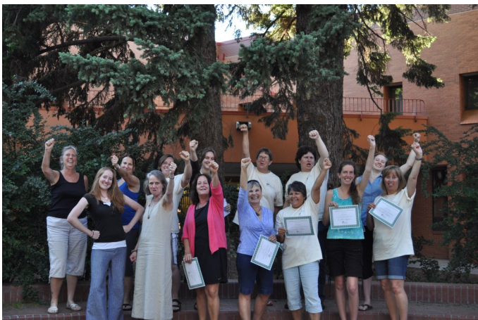
Instructors and participants celebrate the 2013 Academy!

Project Archaeology conducted a Leadership Academy (June 24-28, 2013) for social studies and science teachers from throughout the United States to learn about cultural resources on public lands and the importance of protecting these lands for their scientific and heritage values. The Academy, funded by a grant from the Bureau of Land Management, focused on the curriculum Project Archaeology: Investigating Shelter , and an investiga-